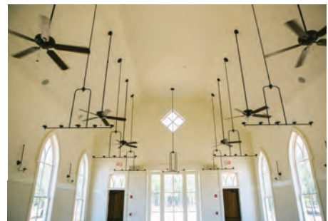
Situated in the center of Old Town, the Town Hall is the focal point of the community.

Our Town Hall is the perfect spot for an intimate Southern wedding. The white clapboard, large Gothic windows drench the space in natural light & add to the special ambiance. The floors of the Town Hall are laid with over 1000 square feet of gorgeous heart pine.